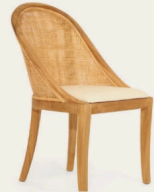
Marley Dining Chair Serrata Living