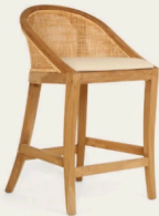
Marley Counter Stool Serrata Living