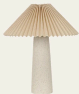
Lora Table Lamp Beacon Lighting