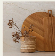
Woven Baskets Her-Hands