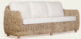
Mason Sofa Serrata Living