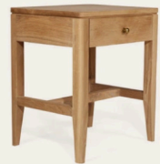
Cora Bedside Table Abide Interiors