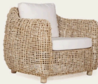
Mason Occasional Chair Serrata Living