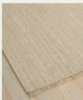
Puglia Hemp Rug Weave Home