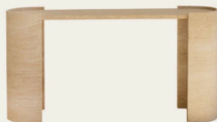
Haven Console By West