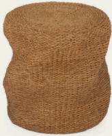
Cove Stool Side Table Serrata Living

Thanks to our supplier partners for working with us on this beautiful home styling project.