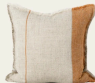
Cushions Baya Living