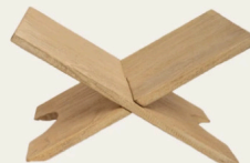
Elm Book Stand Alfresco Emporium