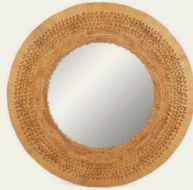
Paloma Mirror Serrata Living